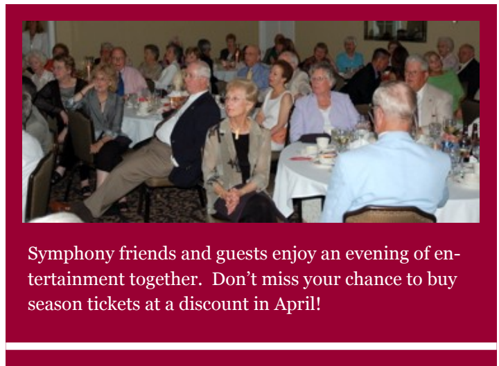
Symphony friends and guests enjoy an evening of entertainment together. Don't miss your chance to buy season tickets at a discount in April!

Join us for the rest of the season – the music is varied and sure to be memorable!